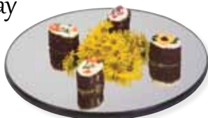
Mirror Tray 22" Round, 1/4" plate glass Model 276