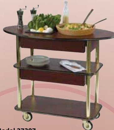
Salad Cart Laminate