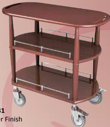
Serving Cart Wood Veneer