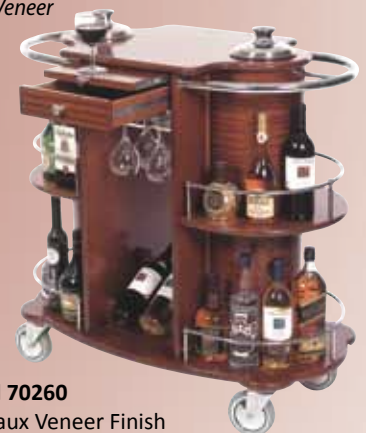
Liquor Cart Wood Veneer