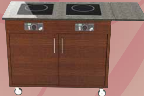
Induction Cooking Cart Wood Veneer