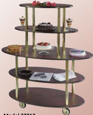
Dessert Cart Laminate

Elevate the patient/resident dining experience by serving on an attractive Geneva cart.