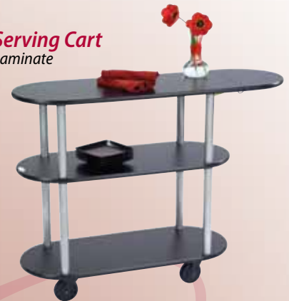
Serving Cart Laminate