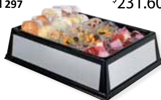
12 x 20 x 6", insulated acrylic Model 297